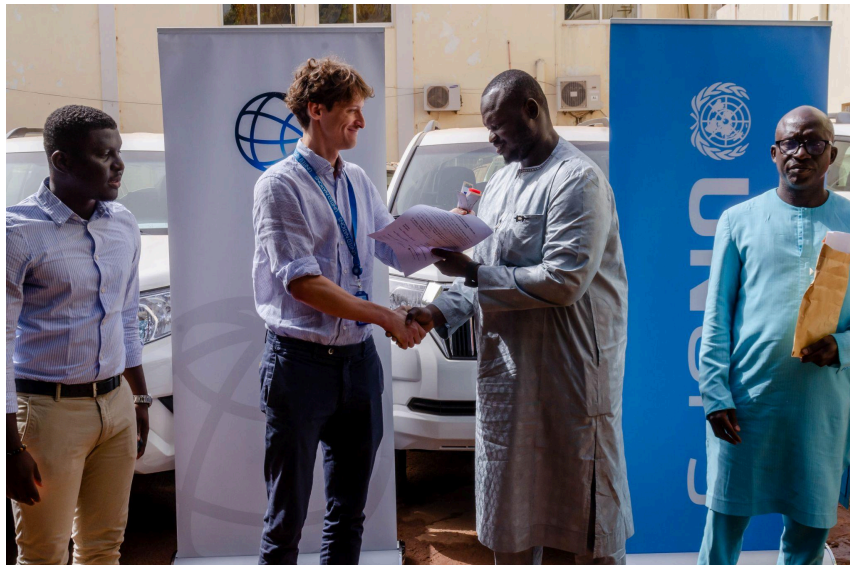
Vehicle keys and ownership certificates are handed over from UNOPS Gambia to The Gambia Bureau of Statistics

"UNOPS is delighted to partner with the World Bank in The Gambia to support The Gambia Bureau of Statistics in strengthening its mobility for improved data collection in the national population and housing census. The availability of quality data is crucial for any effective development planning and we are pleased to be part of this all-important national exercise. We extend our appreciation to the World Bank and the government of The Gambia for their trust to deliver this important project for the people of The Gambia and we look forward to a continued partnership with them."