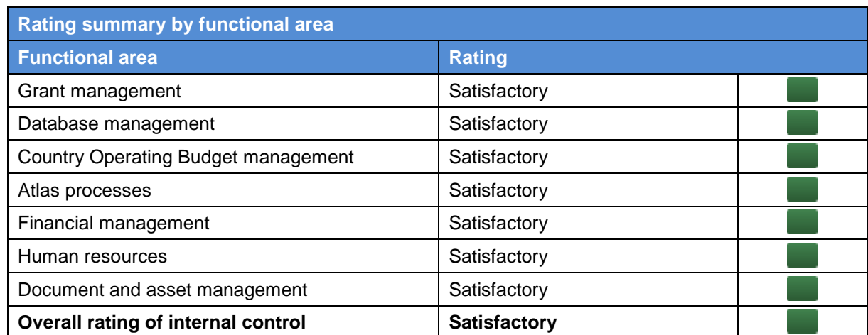
Table 2: Internal control rating summary for project